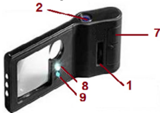
Fig 2 – Back view